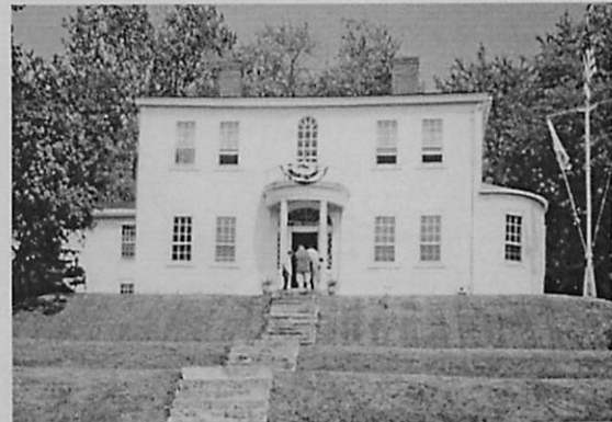
The Reid Mansion, Waldoboro

(showing the U.S. Post Office, the Hall Funeral Home, and the Broad Bay Congregational Church)