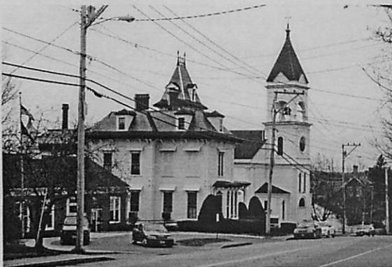
Main Street, Waldoboro

(showing the U.S. Post Office, the Hall Funeral Home, and the Broad Bay Congregational Church)